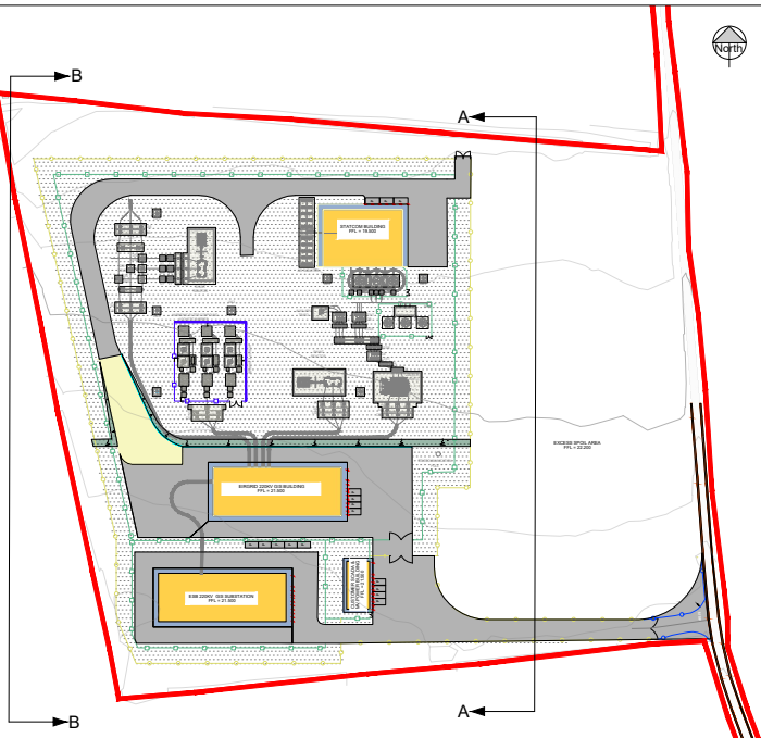
KEY PLAN (NOT TO SCALE)